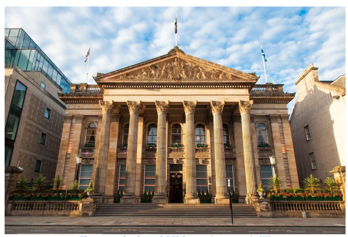
The venue that hosted GCE Symposium event in UK

The UK Rural GCE promotional event took place at The Dome (Charlotte Suite) in Edinburgh on 29<sup>th</sup> August 2022. The event attracted 16 participants.